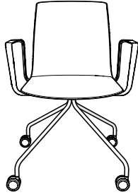
FI75510 Shown with optional arms