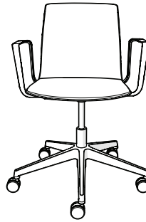
FI75310 Shown with optional arms