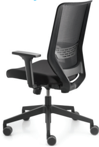
SYNC 2 DESK CHAIR & STOOL