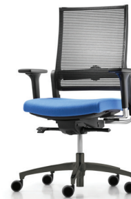
$30 LORDO DESK CHAIR & STOOL