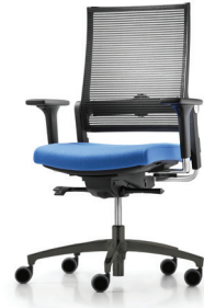
LORDO DESK CHAIR & STOOL