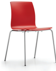
ALL SIDE CHAIRS