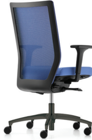
STILO DESK CHAIR & STOOL