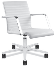
ALL SWIVEL CHAIRS