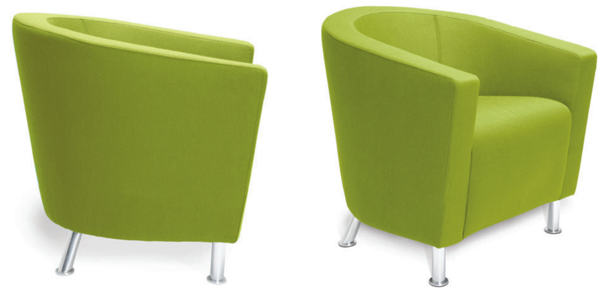
CC 0010 Single Seat